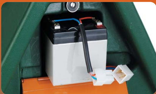
Optional rechargeable battery 2 months between charges*