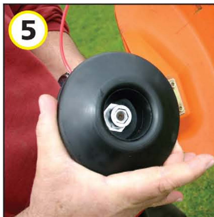
5 Wind head onto gearbox until hand-tight. Remember it could be a left hand thread!