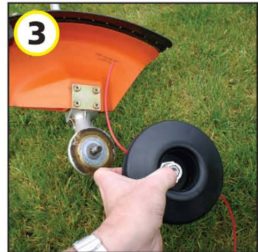
3 Locate unit onto the gearbox making sure it is centred and the right collett is selected.