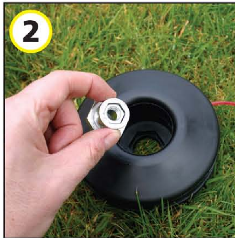
2 Place nut or bolt inside collett, and push into recess of head.