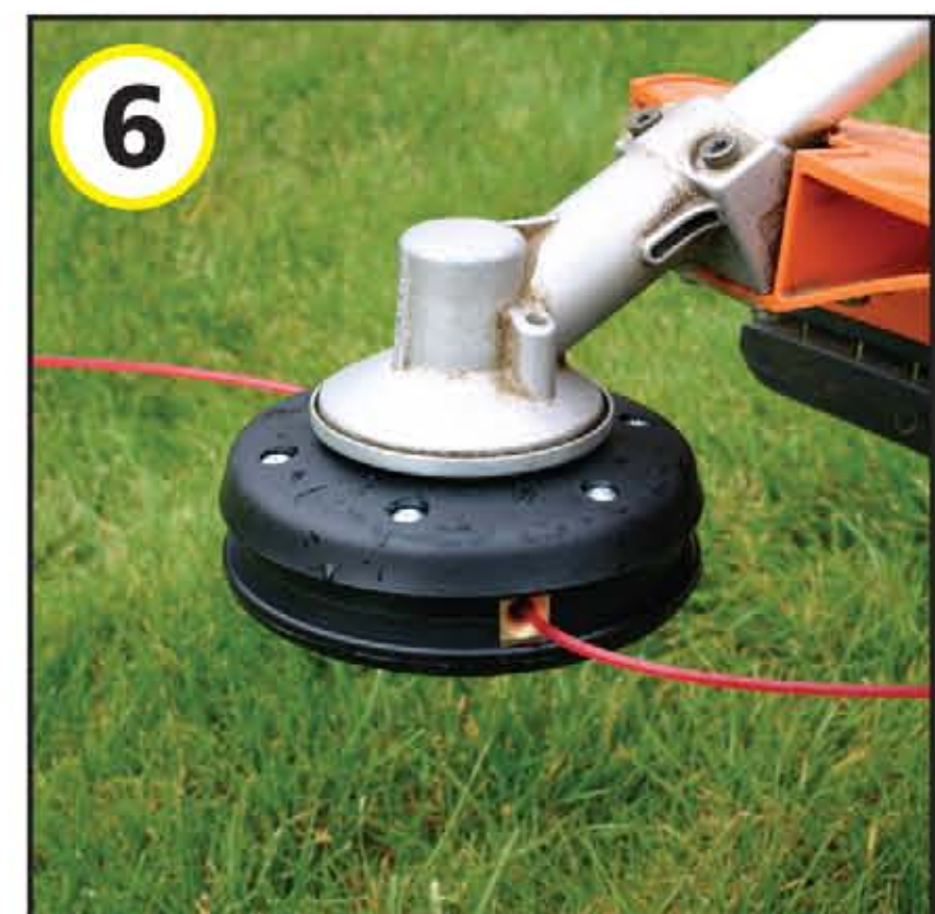
6 Job Done! Ready to go.

Fits Most Straight Shaft Petrol Strimmers